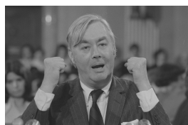
The Other Half of the Moynihan Report

Moreover, Moynihan's concern about the declining rates of two-parent households would have struck the average black resident of Harlem in 1965 as well placed. Nationalist leaders like Malcolm X drew much of their appeal through their calls for shoring up the black family.