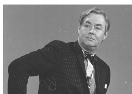
Moynihan's 1964 Memo to Labor Secretary W. Willard Wirtz

Mass incarceration is, ultimately, a problem of troublesome entanglements. To war seriously against the disparity in unfreedom requires a war against a disparity in resources. And to war against a disparity in resources is to confront a history in which both the plunder and the mass incarceration of blacks are accepted commonplaces. Our current debate over criminal-justice reform pretends that it is possible to disentangle ourselves without significantly disturbing the other aspects of our lives, that one can extract the thread of mass incarceration from the larger tapestry of racist American policy.